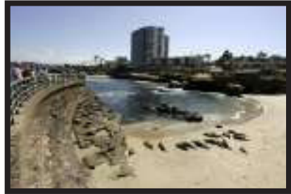
Harbour seals at La Jolla

Over 200 seals won a 10-year battle between those who want to protect California's top seal-spotting places and local residents who want to use the protected cove that was originally built as a kids swimming area.