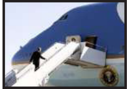
US President George Bush boards Air Force One

A fter the visit, Bush commented that he strongly believes that „hydrogen is the fuel of the future,“ and not just a silly dream.