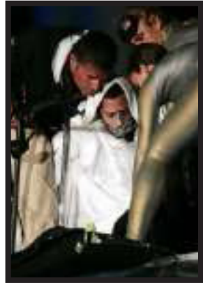
David Blaine is given oxygen after his unsuccessful attempt at record for holding his breath underwater in New York

Blaine's physician advised him not to attempt the escape. He warned Blaine that he could suffer a blackout, a heart attack or a stroke. Although tired, Blaine did not suffer any brain damage from the lack of oxygen.