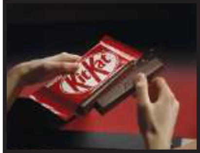
A KitKat chocolate bar

Producers of the show got the idea for their latest stunt from „Charlie and the Chocolate Factory“, where Willy Wonka placed golden tickets in his Wonka bars. The lucky winners got a tour of the famed chocolate factory while learning some valuable lessons.