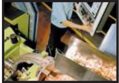
Royal Mint Employee

The value of copper is on the rise and some may see a profitable future in it. The Royal Mint has warned people against melting down the 1p and 2p copper coins for the metal.