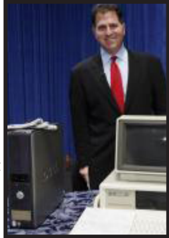
Michael Dell, chairman and CEO of Dell Inc