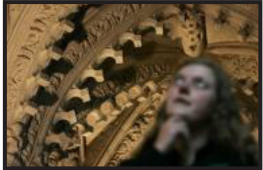
A tourist looks at the cube carvings on the chapel arches at Rosslyn Chapel near Edinburgh