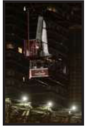
Roosevelt Island Tram