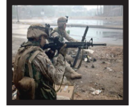
Special Forces unit