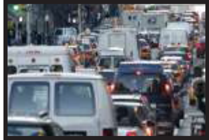
Traffic sits at a stand still on Lexington Avenue during the morning commute in New York

H is trip landed him first place among almost 3,000 entries in the search for America's longest commute, sponsored by automotive services provider Midas Inc.