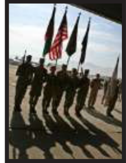
U.S. soldiers hold flags during a change-of-command ceremony

The Army cited a 2003 survey of 1,010 people conducted at the Scripps Survey Research Centre at Ohio University that found that roughly 30 percent of US adults under age 30 have tattoos.