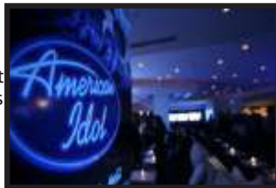
Guests mingle at party for 12 finalists of "American Idol" in Los Angeles

I t also comes after CBS Corp. made the „March Madness“ NCAA college basketball playoff games available online. General Electric Co.'s NBC started offering programs for sale on Apple Computer Inc.'s iTunes downloading service last December.