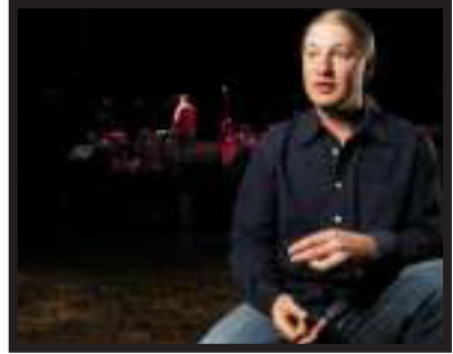
Guitarist Trucks speaks before his sold-out concert in Washington

Intent on developing his own style, he said he stopped listening to blues guitarists for long periods and instead paid attention to singers, horn players and Indian classical music. Trucks does not use a pick and his slide notes slice through vintage amplifiers, unmodified by the effects pedals favored by many electric guitarists.