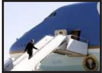
US President George Bush boards Air Force One

With oil prices hitting a record high this week and gas at the pump topping 3 dollars a gallon in some places, Bush said he knew Americans were suffering and predicted a „tough“ summer driving season.