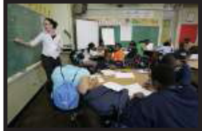
A teacher leads her class in a math lesson

According to a new study from teachers' union the National Education Association, half of new US teachers are likely to quit within the first five years because of poor working conditions and low salaries.