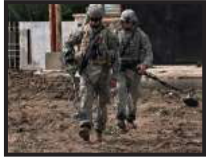
US soldiers search for weapons caches in Baghdad

While the other branches of the military exceeded their recruiting goals last year, the Army, which provides the bulk of US ground forces in the Iraq war, missed its target by about 9 percent, and lagged slightly behind last year's numbers during the first half of fiscal 2006.