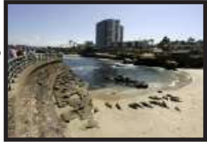
Harbour seals at La Jolla

A school of about 200 harbour seals has won the battle between those who want to protect one of California's top seal-spotting places and those who cherish the „Children's Pool“, a cove built 70 years ago to give tots a safe place to swim.