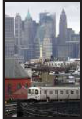
Subway train pulls into station in Brooklyn